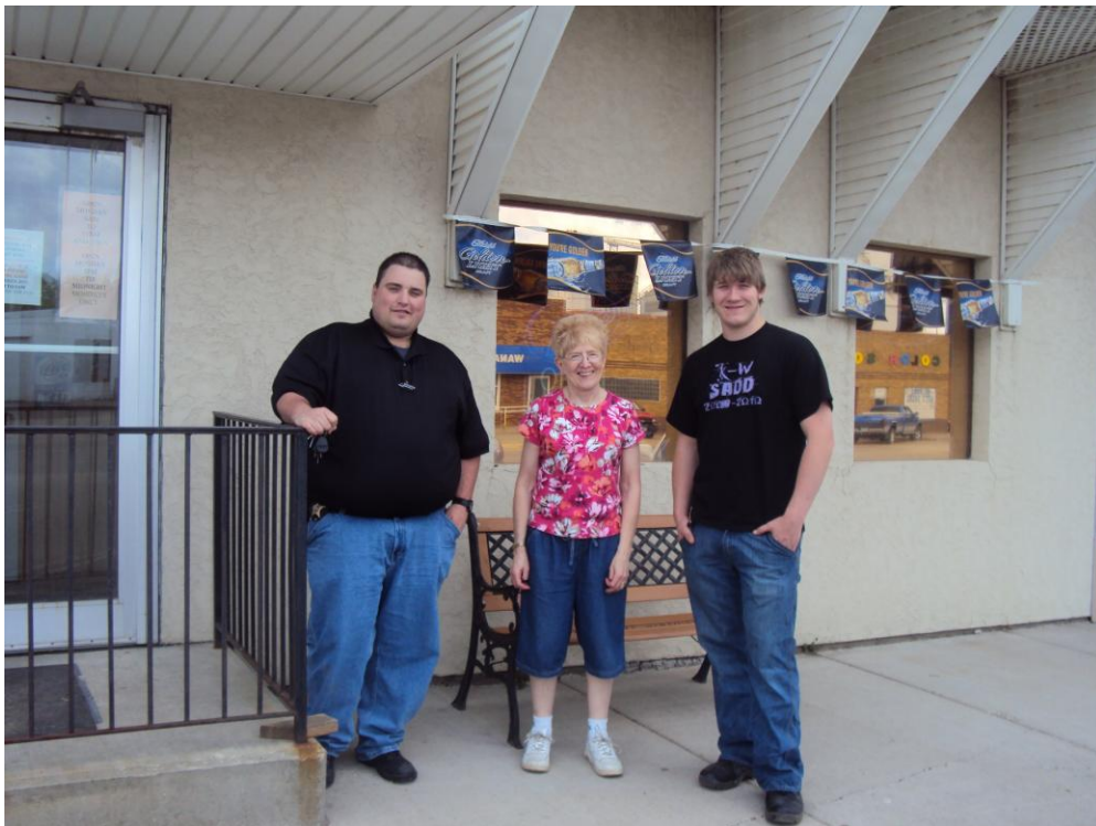
Outside Ringo's Bar and Grill in Wanamingo