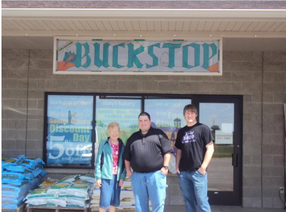
Outside Home Town Wine & Spirits (Barney's) in Wanamingo